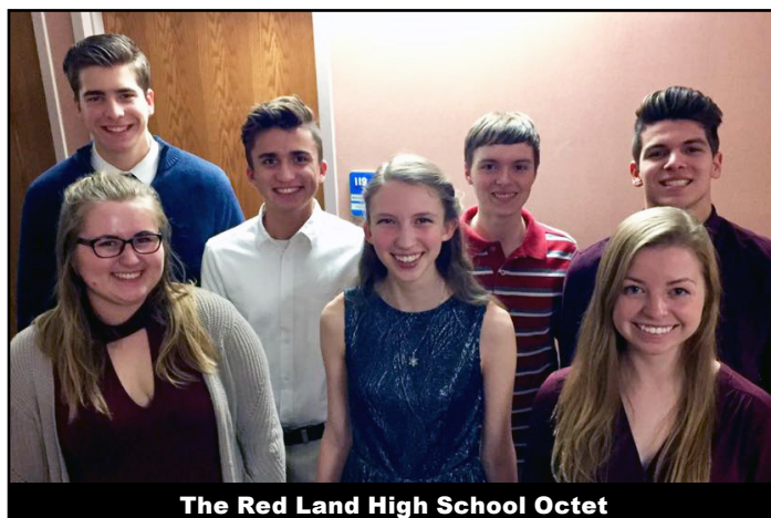
The Red Land High School Octet

Prior to the start of the meeting the Red Land High School Octet (minus one member) sang several holiday tunes. Student vocalists included: