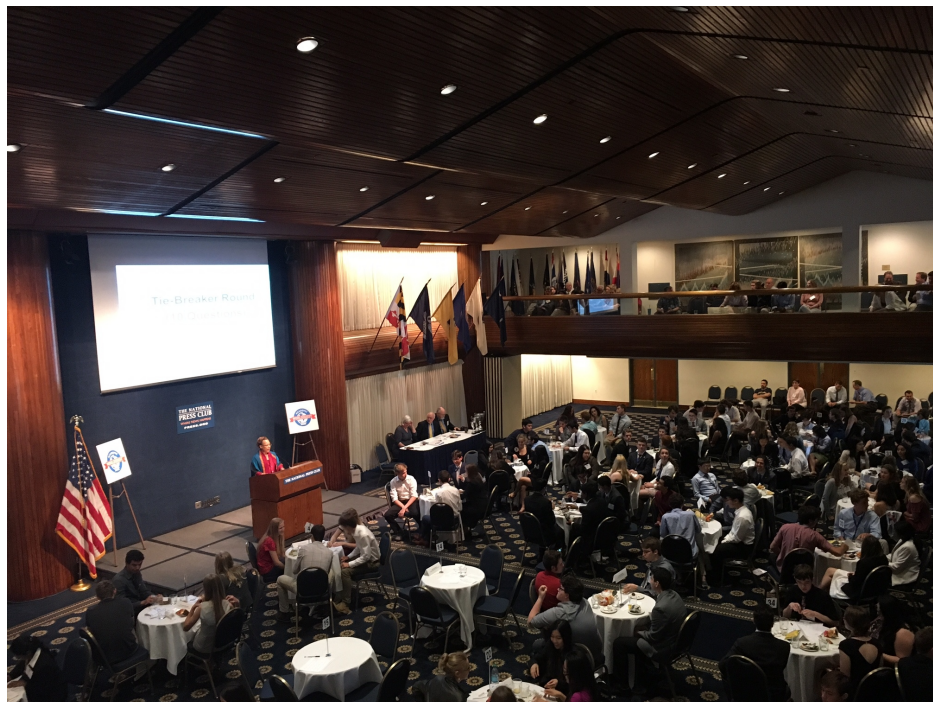
National Competition at the National Press Club, Washington D.C.