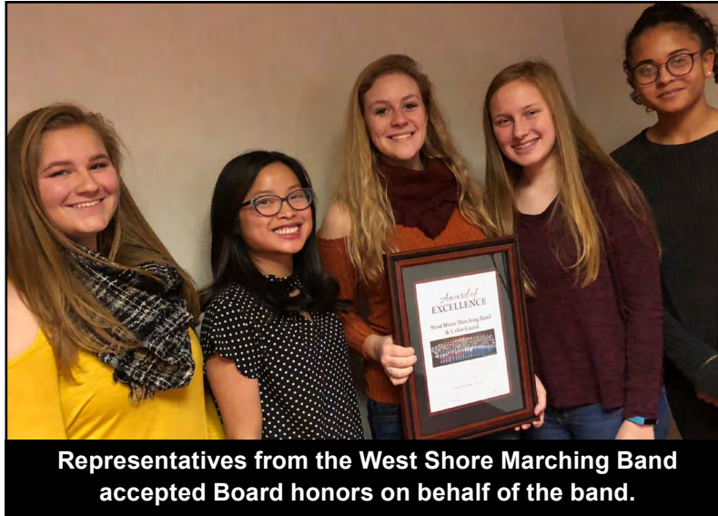
Representatives from the West Shore Marching Band accepted Board honors on behalf of the band.